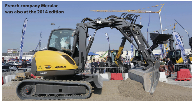
French company Mecalac was also at the 2014 edition