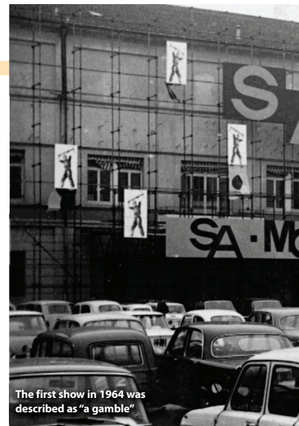
The first show in 1964 was described as "a gamble"

three years. An agreement was forged with Bauma in Munich and Intermat in Paris, so that the major European shows did not clash.